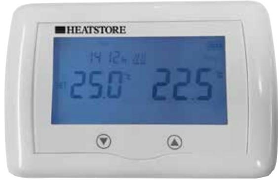
HSSLCRF SECONDARY LOCAL CONTROL

Room occupants can temporarily adjust the room temperature using the HSSLCRF for a predetermined length of time reverting back to the programmed temperature set by the HSMLCRF.