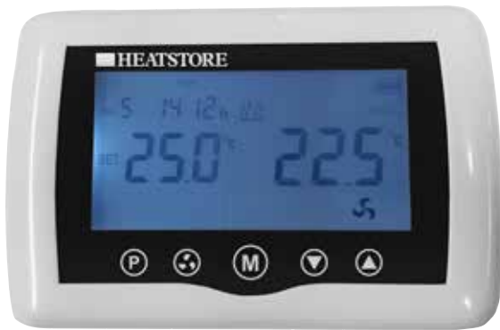
HSMLCRF MASTER LANDLORD CONTROL