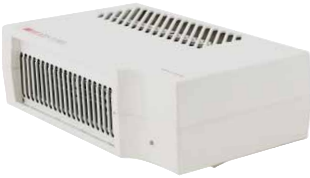
HSBH2RF BATHROOM DOWNFLOW FAN HEATER