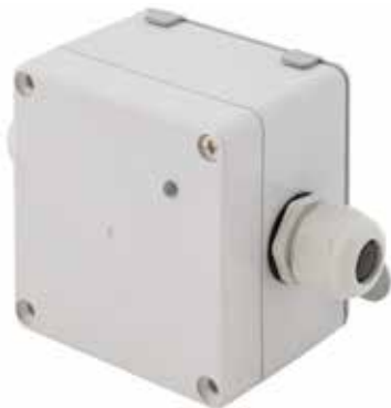
HSBRRF BOOSTER / RECEIVER UNIT