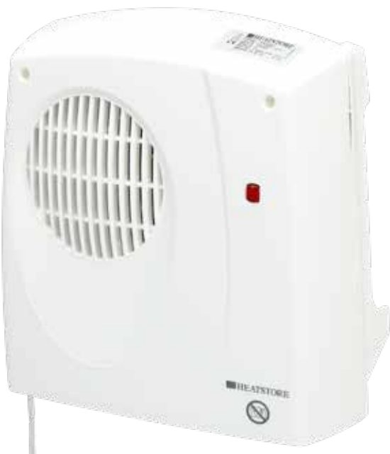
HS2000T 2KW DOWN FLOW HEATER WITH RUN BACK TIMER