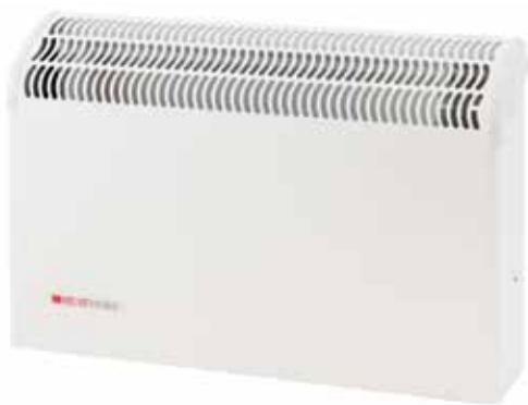
HSCVFRF CONVECTOR HEATER WITH FAN